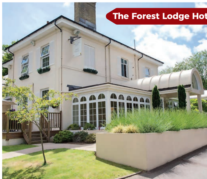
The Forest Lodge Hotel