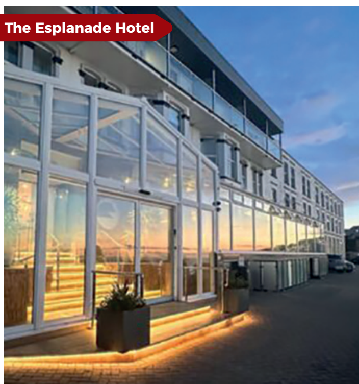
The Esplanade Hotel

Thursday: We have some time in Newquay this morning then follow the coast road to Padstow, this picturesque resort is one of Cornwall's most successful fishing ports set on the Camel Estuary.