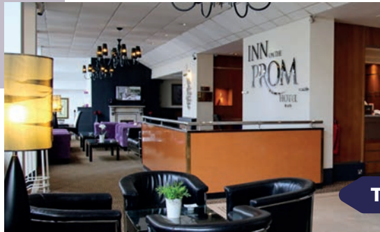
The Inn on the Prom

Monday - Our taxi pick-ups will begin around 08:00 hours this morning and once everyone is on board the coach we will head to Liverpool where we will have a guided tour as well as some time to get lunch and explore the famous Albert Docks area. We then continue to Lytham St Ann's arriving at our hotel about 5pm.