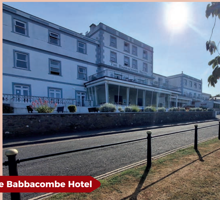
The Babbacombe Hotel

Bingo and Entertainment most nights - Sherry reception and Christmas Dinner one evening - Christmas Gift New Years Eve reception with sparkling wine before dinner.