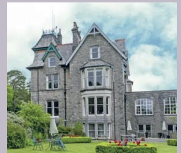
Cumbria Grand Hotel

Friday: We head for home arriving back in our local area late afternoon.