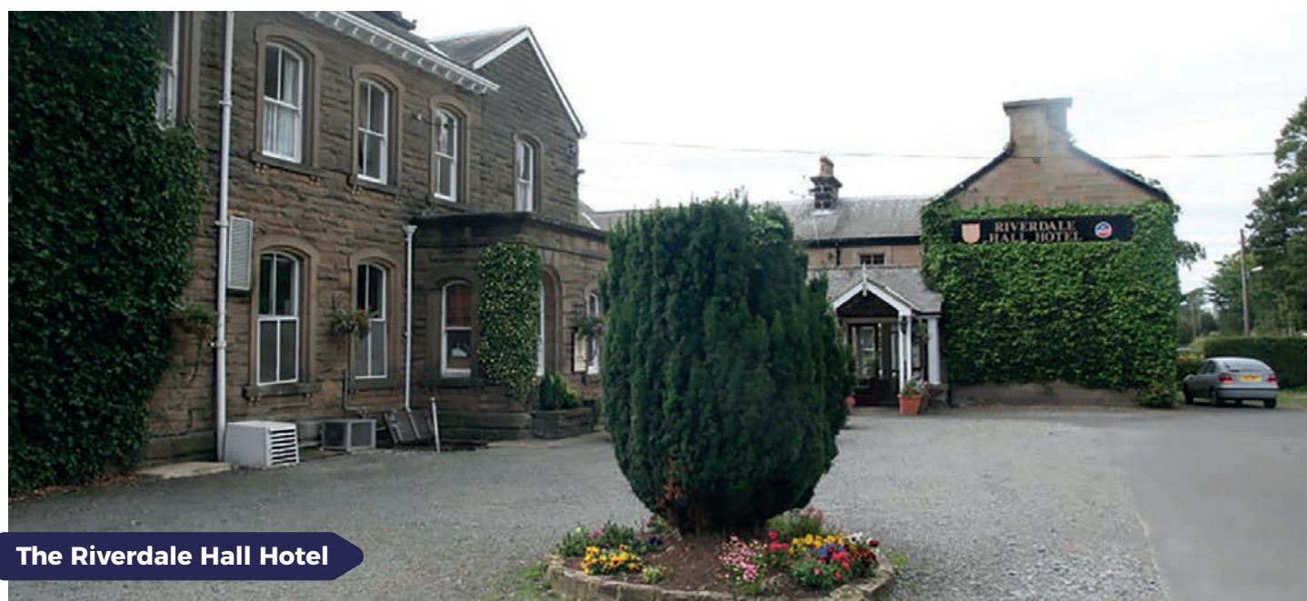
The Riverdale Hall Hotel