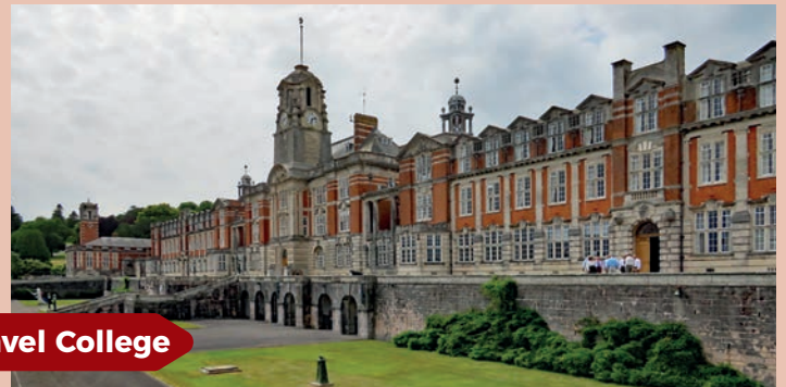
Dartmouth Royal Naval College

£339pp (£15 single supplement) Our itinerary this weekend will include a visit to the Royal Naval College at Dartmouth on Monday morning. We will have a guided tour of this iconic building which has been training naval officers for over 100 years and where Princess Elizabeth first met her future husband.