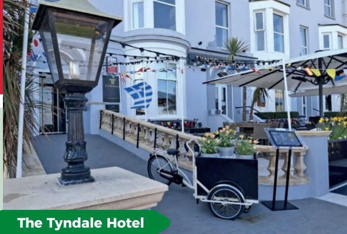
The Tyndale Hotel

The Tyndale Hotel which overlooks Llandudno's promenade, offering great sea views, is without a doubt one of the finest hotels in Llandudno. The food, service and standard of accommodation and live evening entertainment make it a firm favorite with past customers. The hotel has a lift to all floors and the restaurant offers a choice of traditional and modern dishes together with a great range of breakfast options. You must try the porridge with whisky, cream and brown sugar or the Welsh pancakes drizzled with maple syrup. Executive rooms are available at a supplement, please ask when booking.