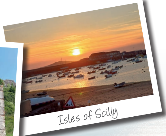
Isles of Scilly