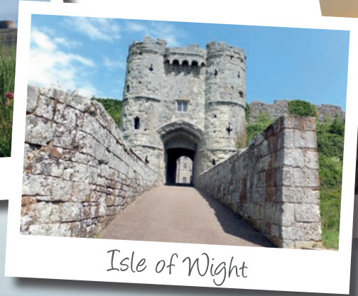
Isle of Wight